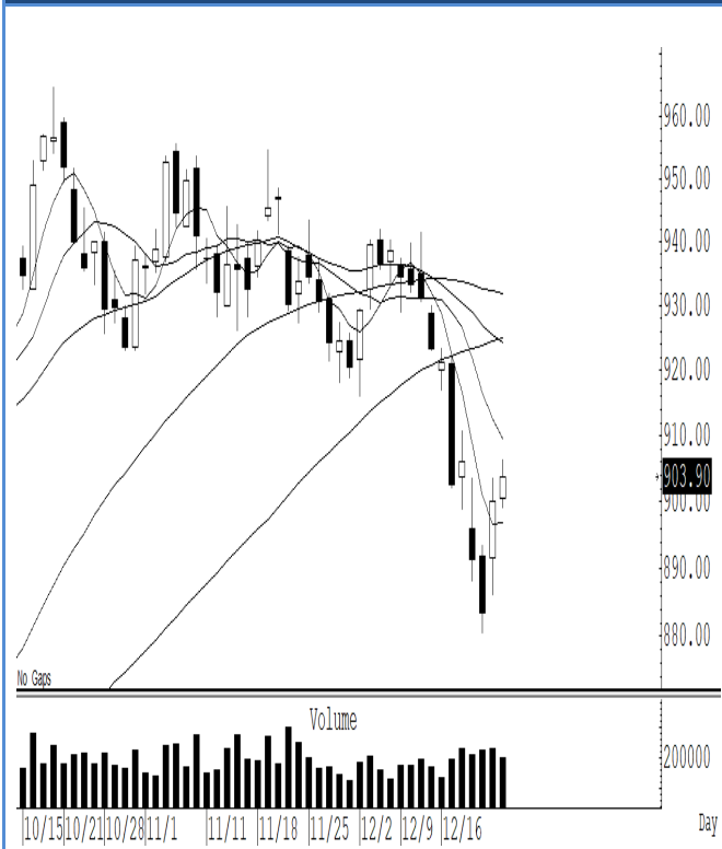
S50Z24 (Close 903.90 Chg 3.90)